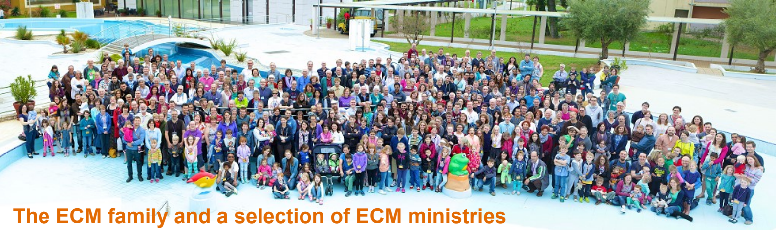
The ECM family and a selection of ECM ministries www.ecmi.org/ministries-in-europe