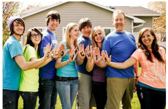
USA team from Spokane